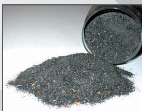
Insulation rice chaff