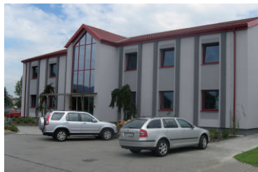
Premise in Bystrice – headquarters and production facilities