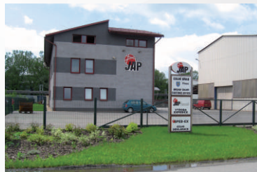
Premise in Trinec-Konska – production and storage facilities